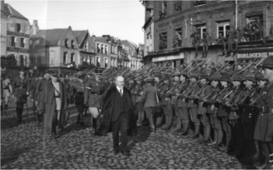
President Raymond Poincaré inspects the New Zealand Division after the liberation of Le Quesnoy on 4 th November 1918. He was so impressed by the action, in which the Division took care to avoid harming the civilian population and the historic architecture, that he drove from Paris to express his gratitude to the New Zealand soldiers.