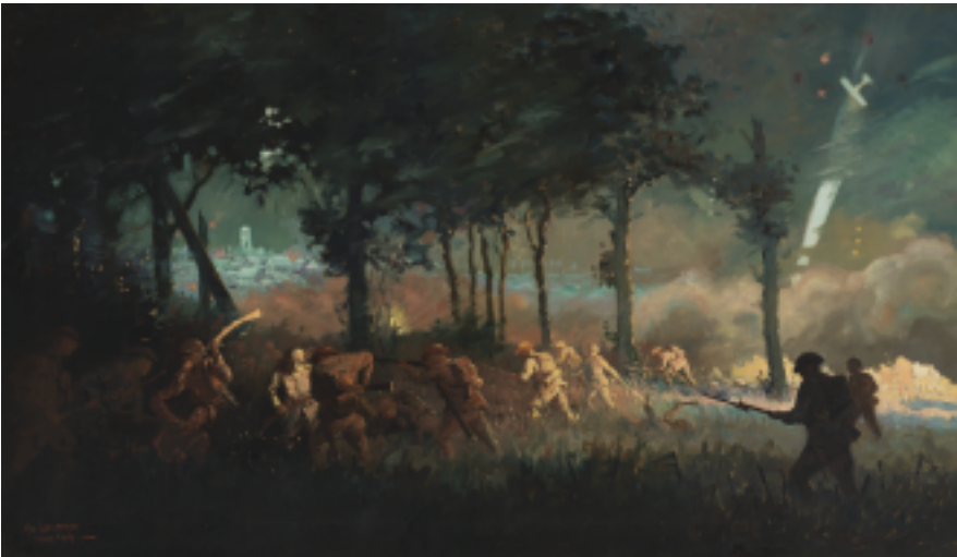
Night attack by 13 th Brigade on Villers-Bretonneux Will Longstaff (1879–1953), oil on canvas, 108 x 184 cm, London, 1919, ART03028, courtesy of the Australian War Memorial, Canberra