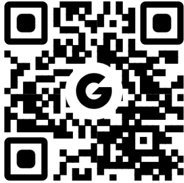
The White Ensign Association