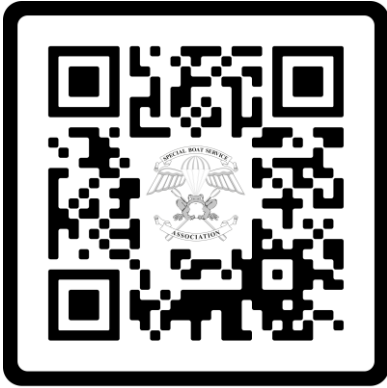
The SBS Association

There will be a retiring collection in aid of The Special Boat Service Association and The White Ensign Association